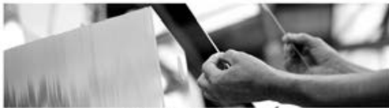
Different type of glass for your framing

HALBE magnetic frames allow comfortable and quick framing from the front. Unlike conventional picture frames, you can insert your pictures from the front without turning, without clamps, springs or corner connectors.