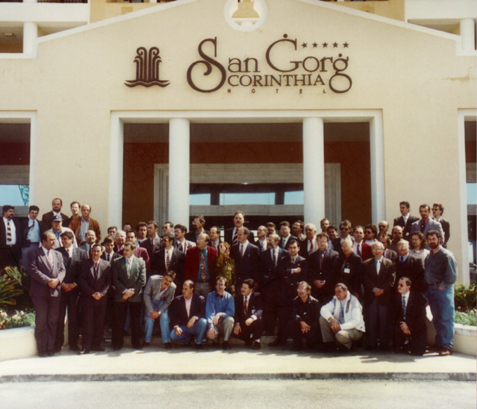
Left: Group photo at Corinthia San Gorg of the first MIPP convention by Attard & Co.